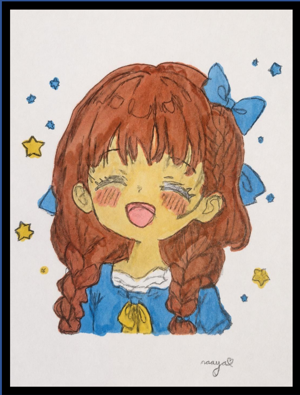
Inaaya, year 5 Beech