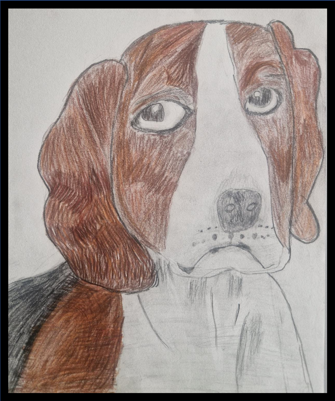
Myra, year 5 Beech