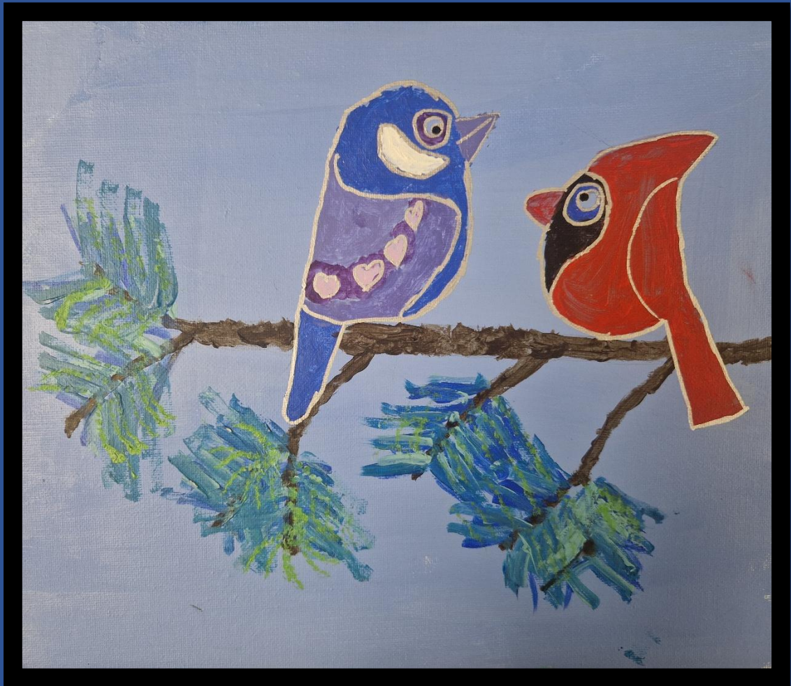
Skye, year 3 Holly