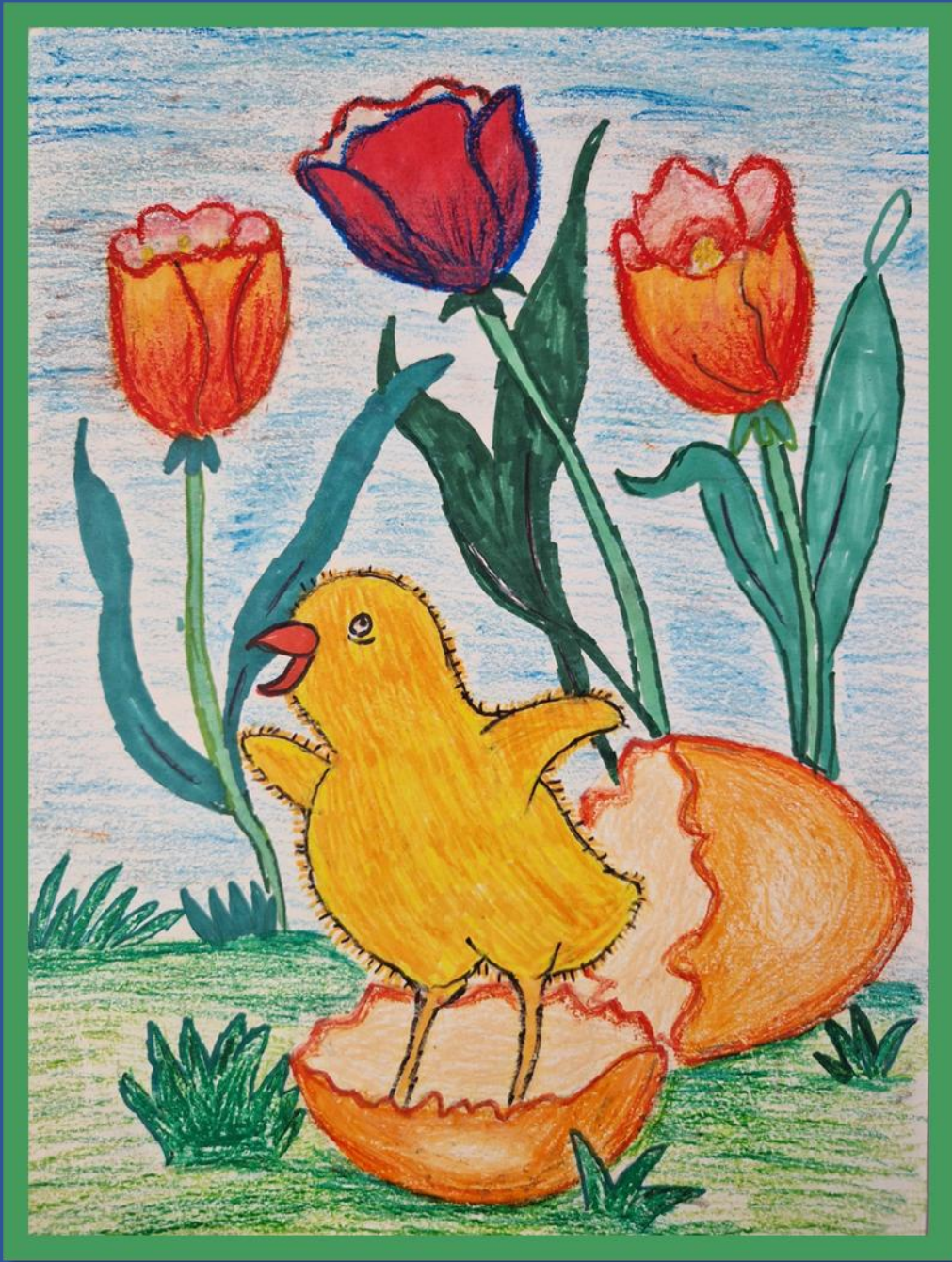
3rd Place: Shivvi, year 4 Willow