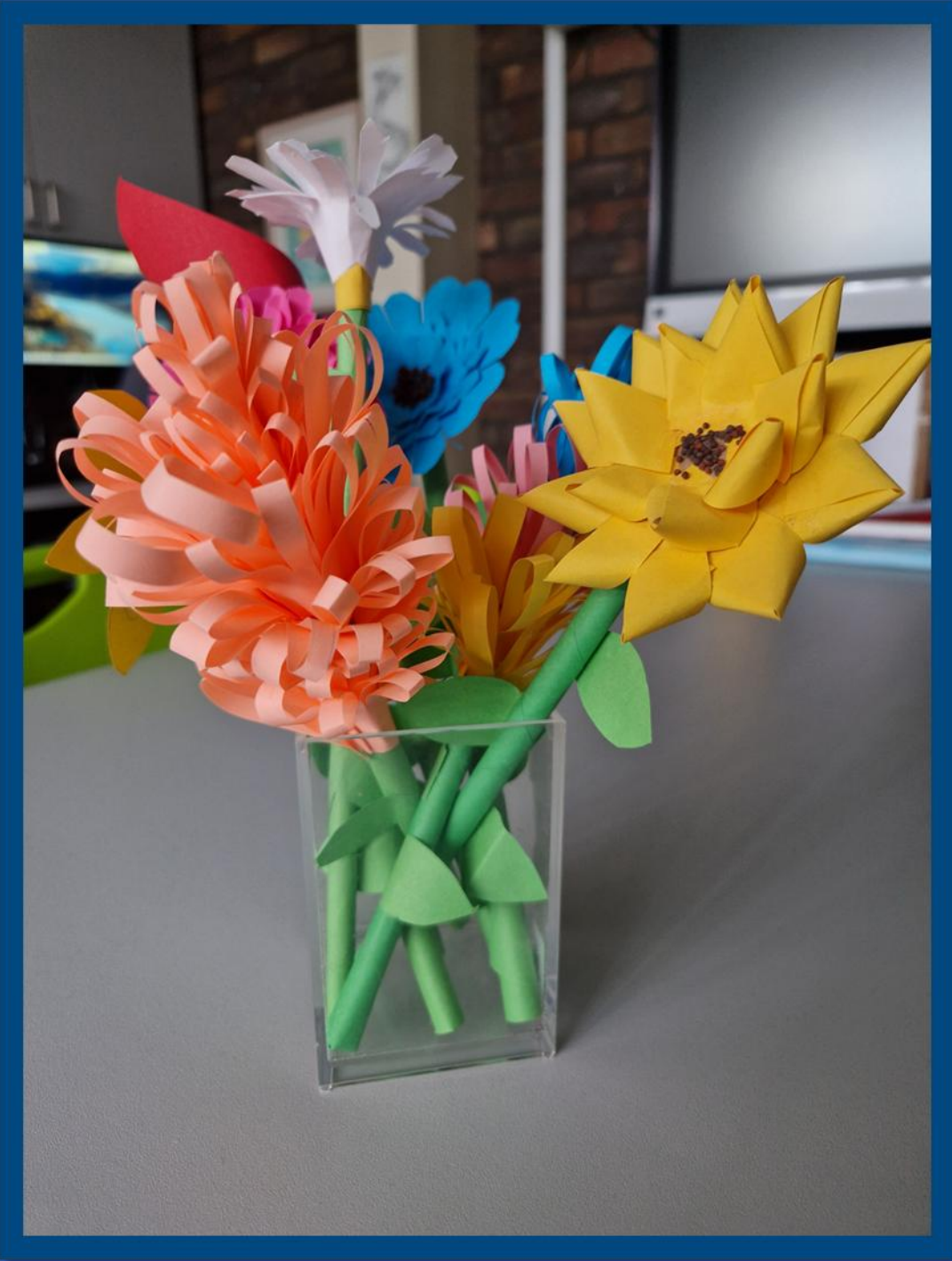
3rd Place: Kushi, year 6 Poplar