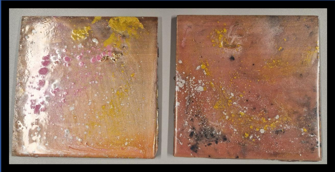
Nya and Nyra (years 3 & 5)