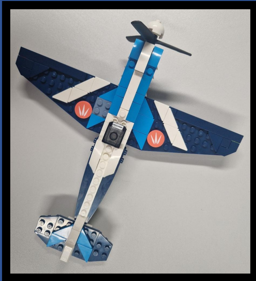
Annabel, year 5 Beech