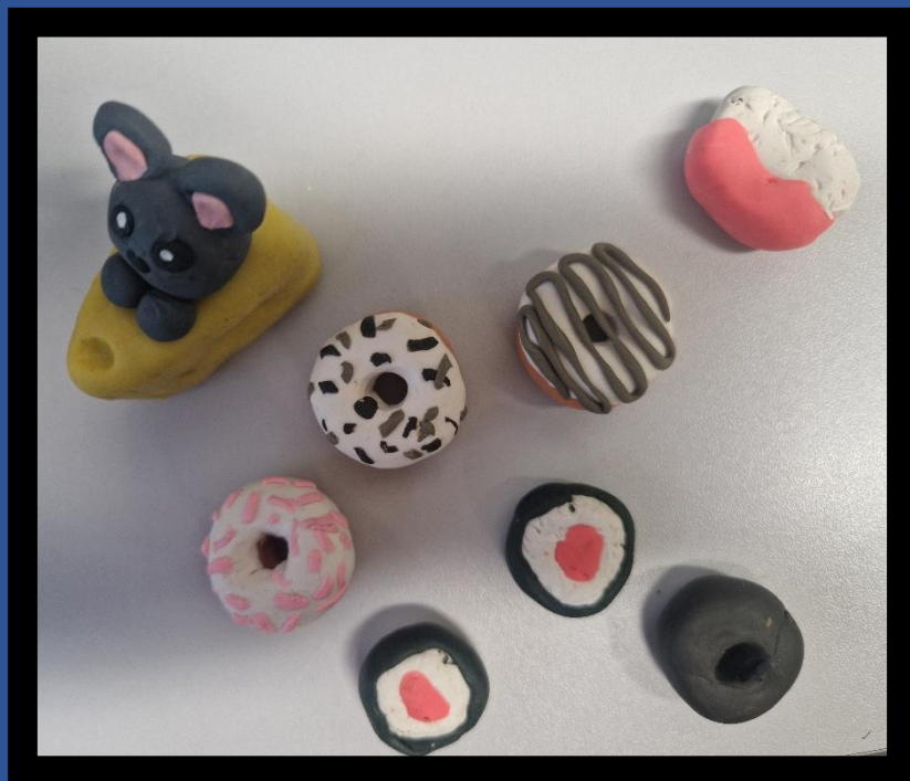
Below: Megha, year 6 Poplar