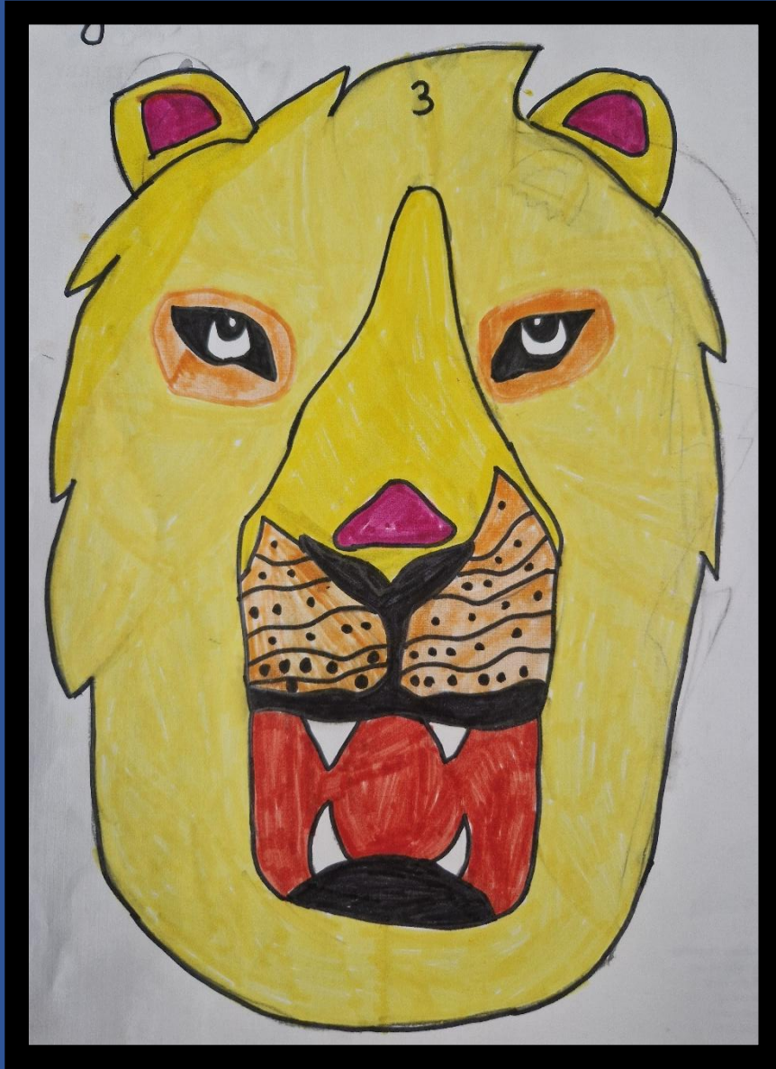
Ruby, year 5 Beech