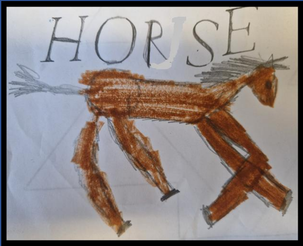
Selase, year 4 Juniper