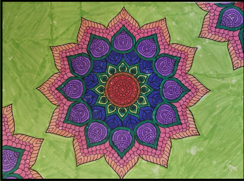
Top: Avantika, Y6 Poplar