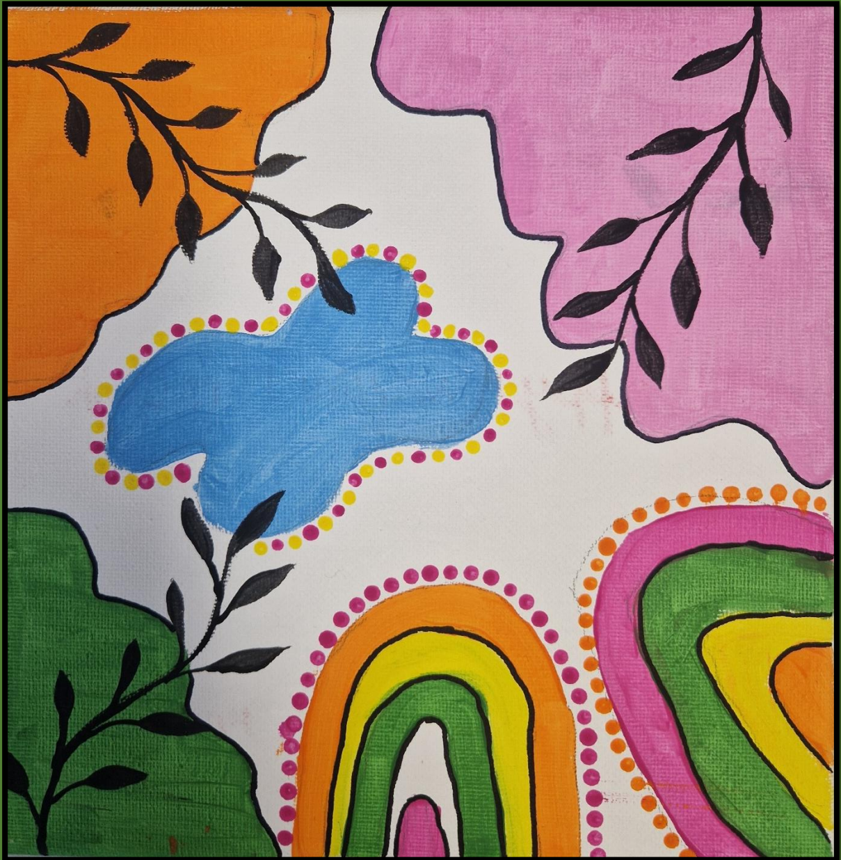
Sai, year 5 Elm