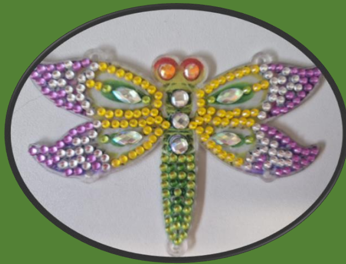
Below: Aleya, Y3 Willow