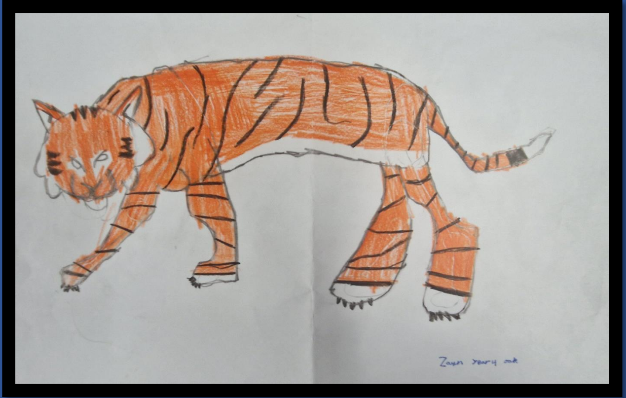
Zayn, Year 4 Oak