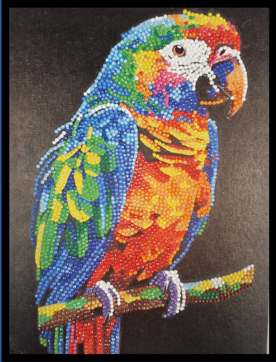
Aaradhya, Year 5 Beech