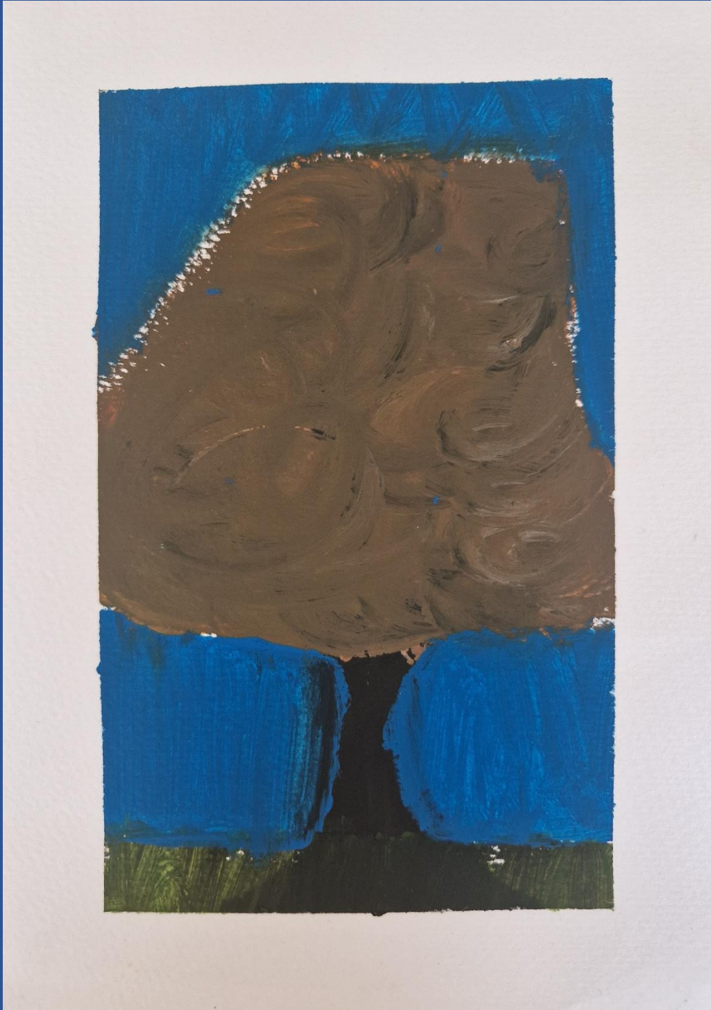
Aditi, year 4 Oak