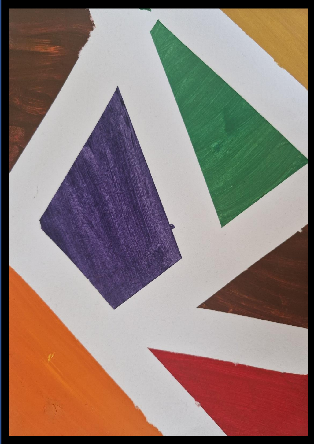
Aditi, year 4 Oak