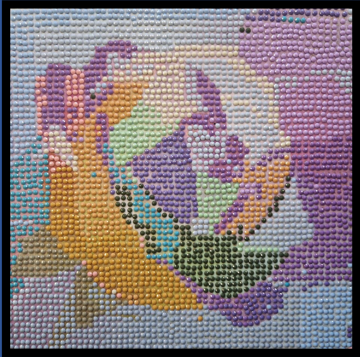
Jaazebah, year 4 Oak