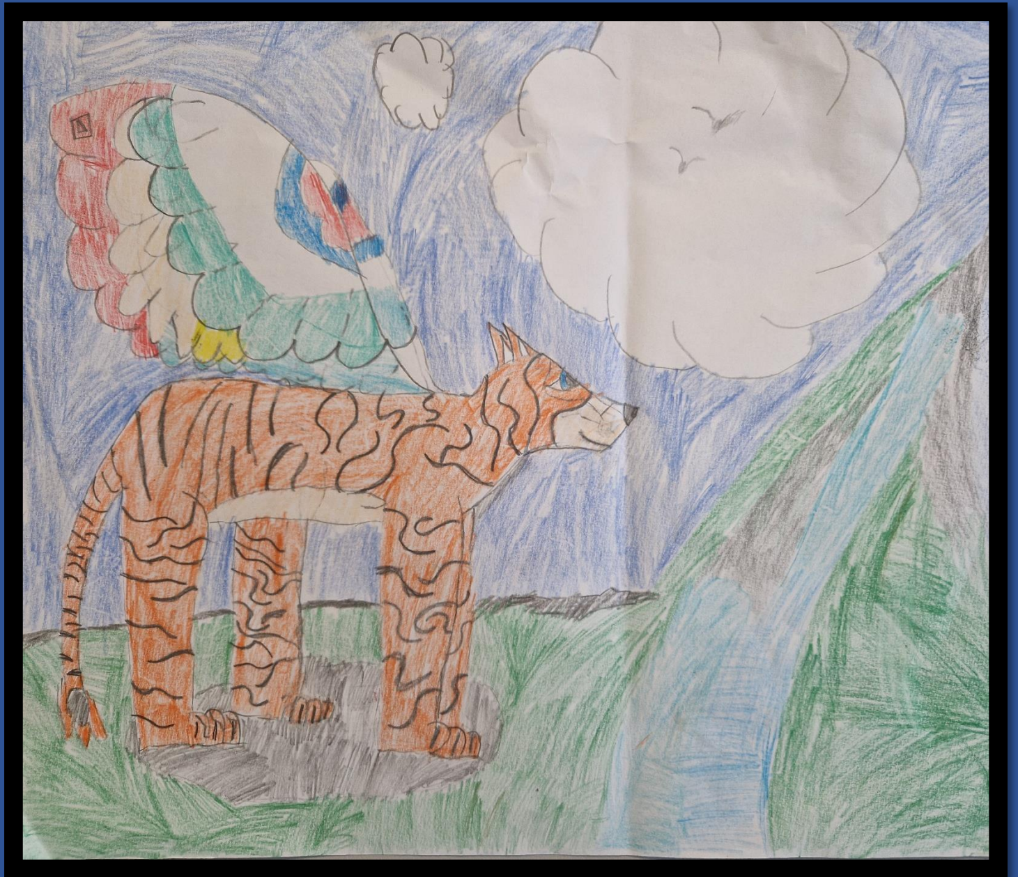
Gabi, year 4 Oak