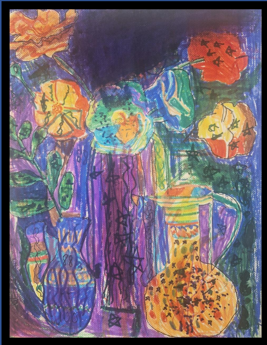
Shahmeer, year 3 Oak