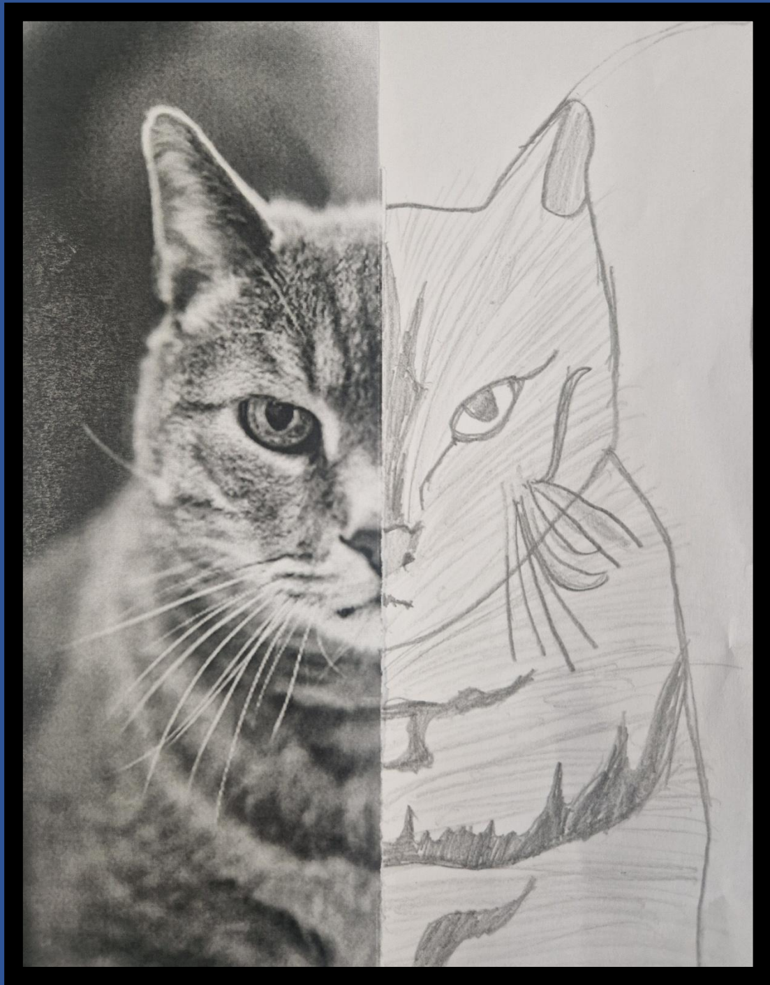
The elegant cat