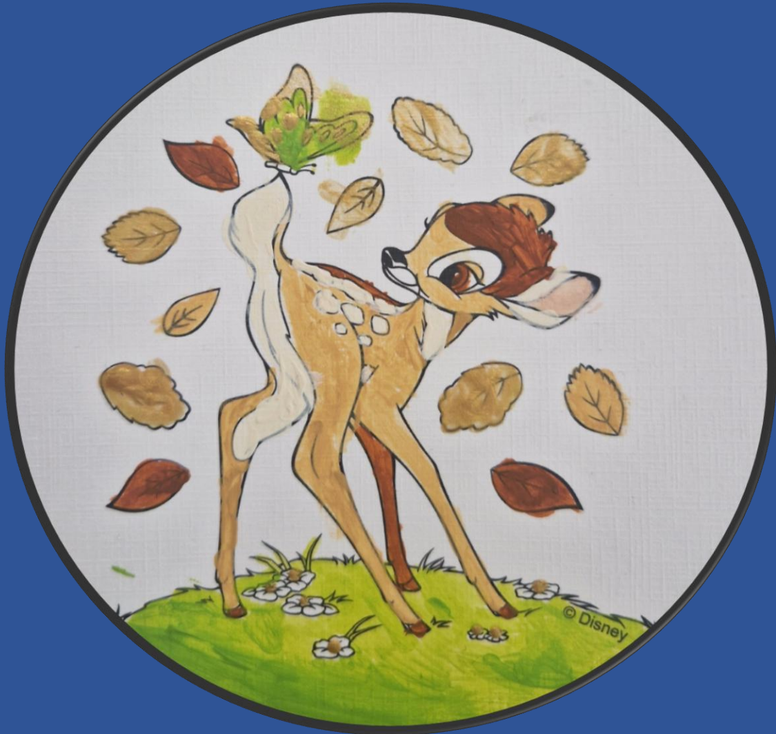
Arya, 3 Oak