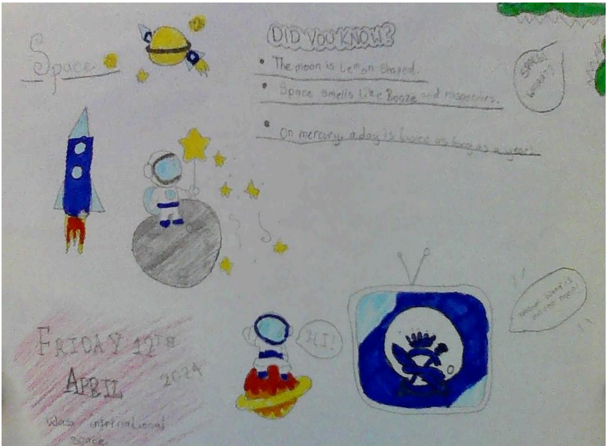
By Khushi Year 6 Poplar