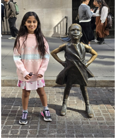
Fearless girl at Wall Street

The Statue of Liberty was a joint effort between France and the United States, intended to commemorate the lasting friendship between the peoples of the two nations. The Statue of Liberty remains an enduring symbol of freedom and democracy, as well as one of the world's most recognizable landmarks.