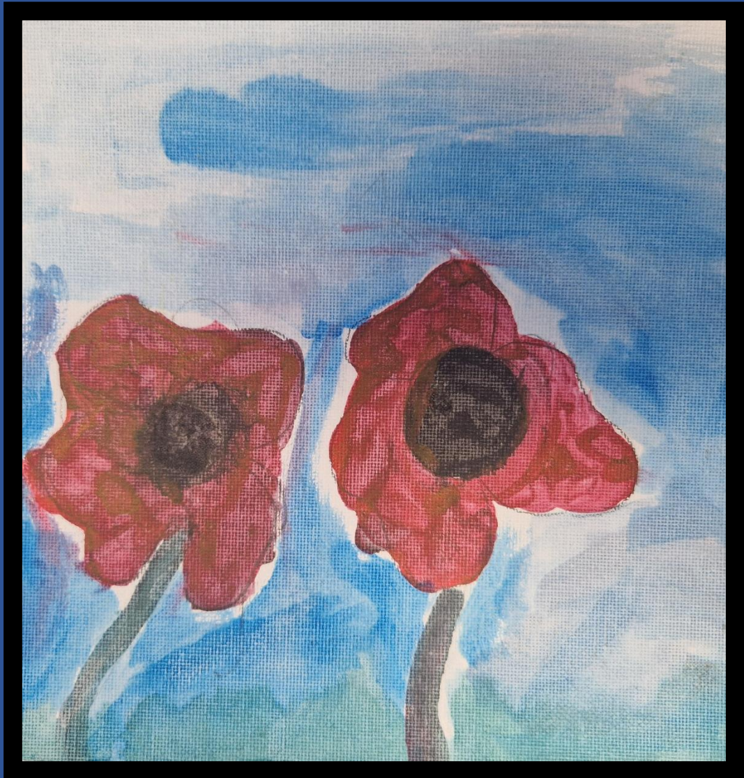
Aditi, year 4 Oak