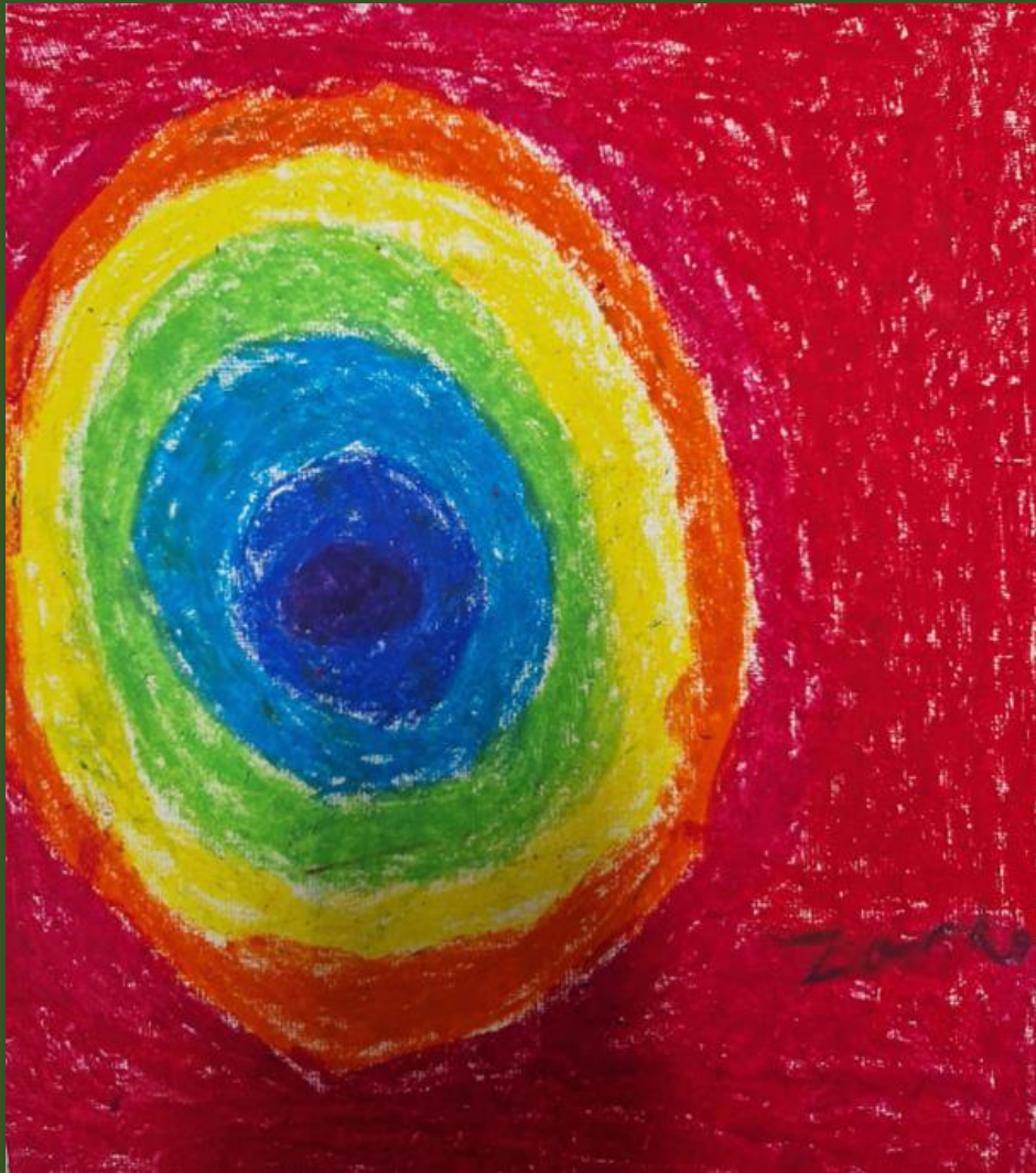
Zara, Juniper class