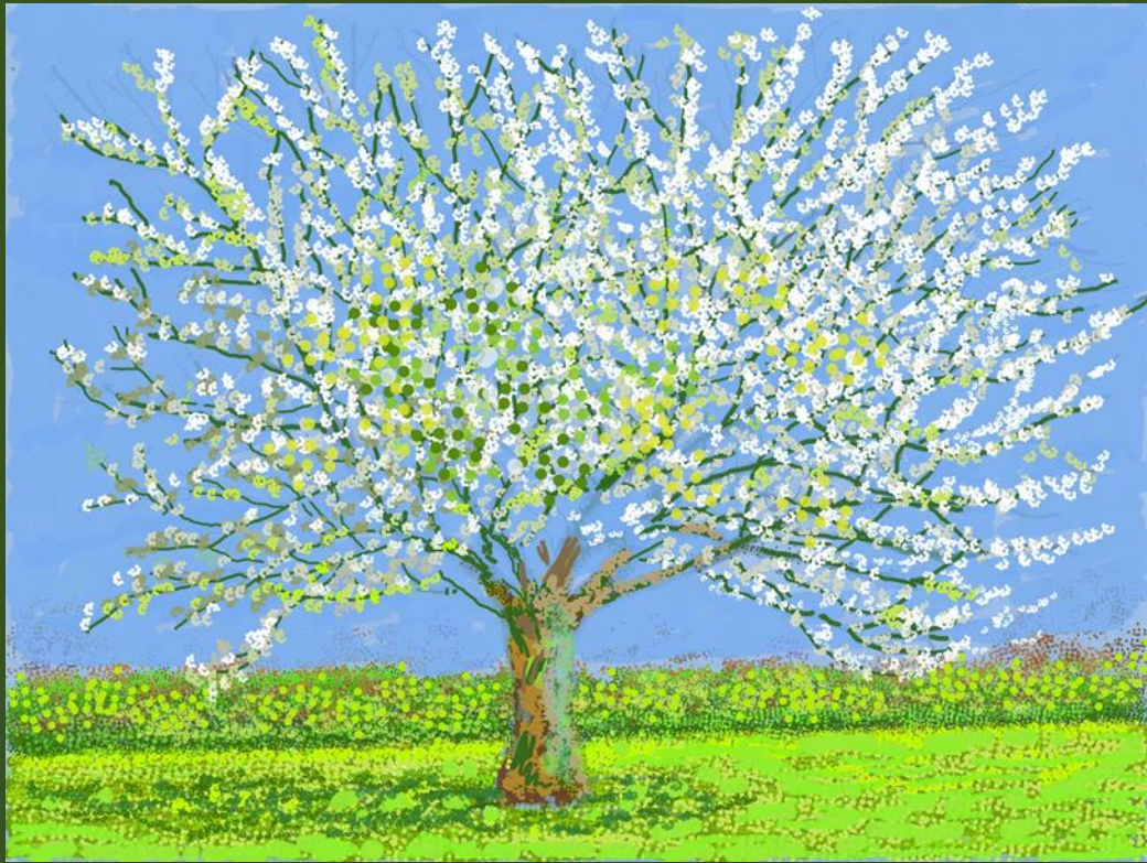
Spring cannot be cancelled, David Hockney