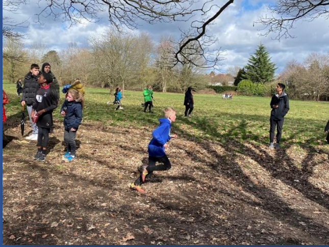
Watford & District Cross Country Final on 25th March